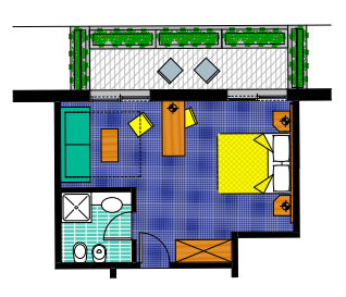
Juniorsuite ca. 25,00 m² Occupation min. 2 people - max 4 people