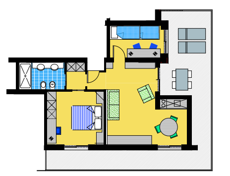
Suite Major ca. 45,00 m², small kitchenette, small living room Occupation min. 4 people - max 6 people