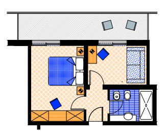
Suite ca. 26,00 m² Occupation min. 2 people - max 2 people