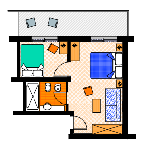
Family Superior ca. 30,00 m², small living room Occupation min. 4 people - max 5 people