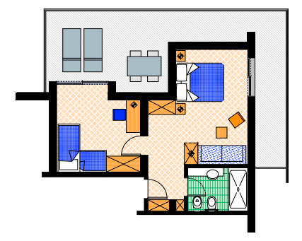
Suite Superior ca. 32,00 m², small living room Occupation min. 4 people - max 5 people